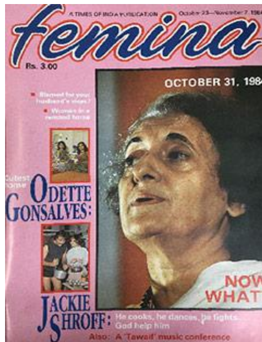
Femina- October, 1984

This pic typically portrays a household activity of cooking. Cooking basically considered as the responsibility of women in Indian society. The Cover page includes main image of celebrity with many dishes on the front. Cover page also includes a cover line that is “ Inside the Beginners Cook Book ”.