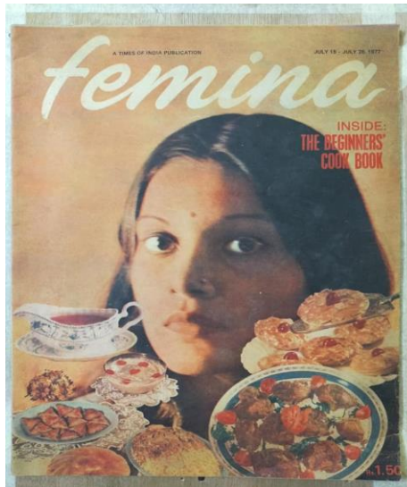
Femina- July 1977

household activity. But at the same time Indira Gandhi is the Prime Minister of that time who was in inspiration for many of Indian Women.