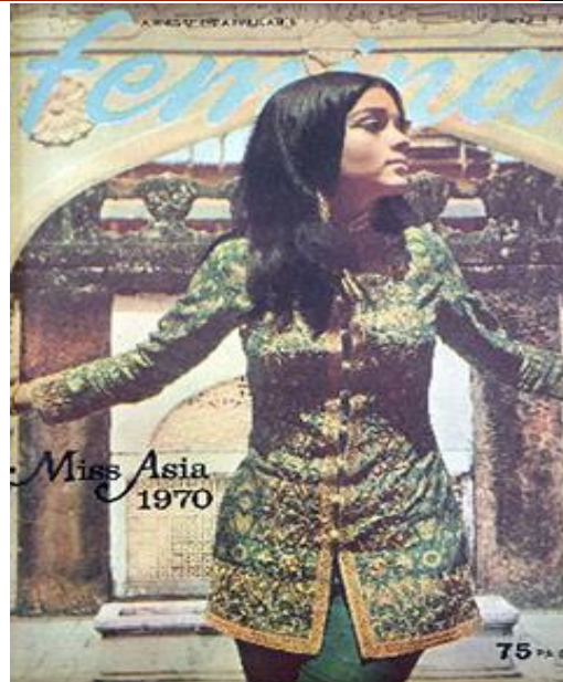
Femina- September, 1970