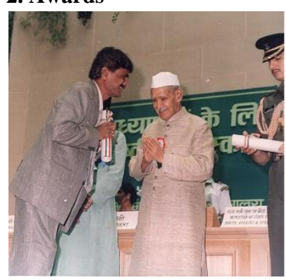
Fig. 2. Best Teacher Award