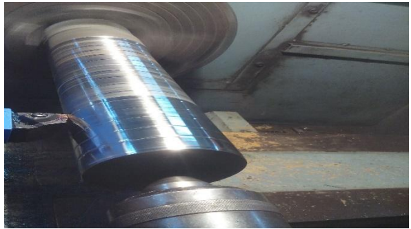
Fig. 2: Experiment performance

Surface roughness of the turned surface was measured using a portable surface roughness tester Mitutoyo SJ210