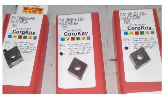
Fig. 1: Cutting tool inserts used in experiment

The cutting tool was SANDVIK KOROMANT CBN cutting insert with three different nose radius, designation of cutting insert CNGA120412, CNGA120408, CNGA120404, The inserts were rigidly mounted on a right hand style tool holder of SANDVIK KOROMANT and its ISO designation was DCLNR-2525 M112.